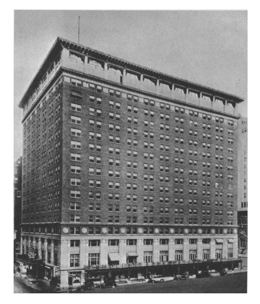
A VIEW OF THE BAKER HOTEL, DALLAS